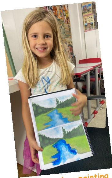
Showing her painting