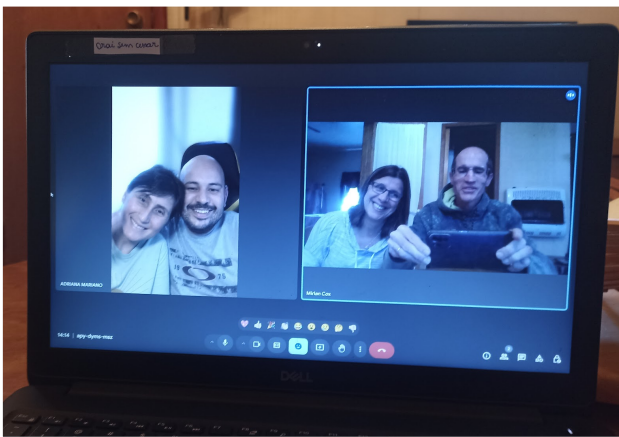
Technology has been a blessing in keeping us connected with our ministry in Brazil, when it works!