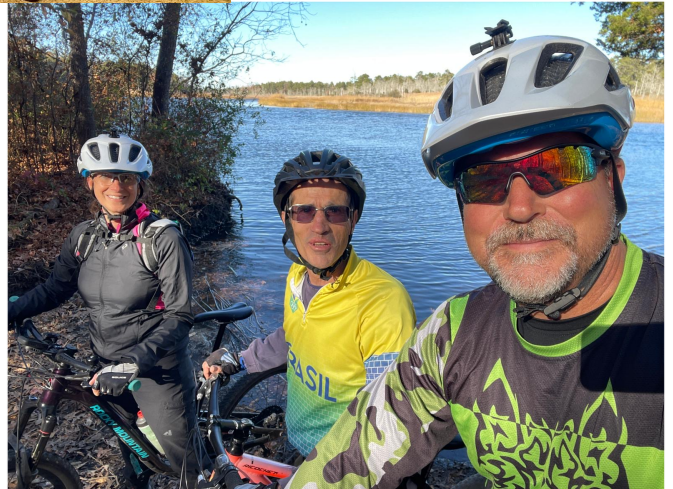
I was able to buy a used bike and have been able to continue my "nature adventures"! (Some of them with friends!)