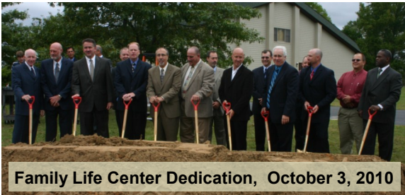
Family Life Center Dedication, October 3, 2010