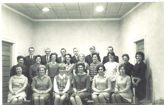
Faith Bible Church Choir - 1970