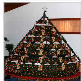
Living Christmas Tree